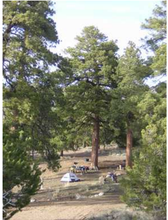
Serious dried ruts on the way up into the Henrys, suggesting why they say these roads may be impassible in wet weather. At right, McMillan Springs BLM Campground at 8400 feet elevation, which I had all to myself. Cold at night but not bad.