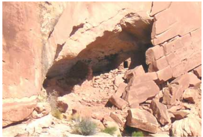
At left is a binocular shot of one of the ruins at the top of the island, the only one that showed much. At right is a ruin in the bottom of the canyon. Unable to descend into the canyon, I couldn't get to any of them. Amazing to think these were abandoned at the time of the Crusades.