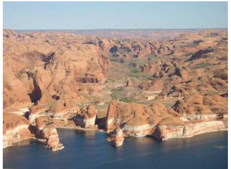
Two views of Lake Powell from the rocks above Hole In The Rock. Camping here was very windy, with no places for shelter on the slickrock. All night sand and dust blew into my tent through the vents and got into everything.