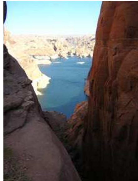
Returning to the west side of Lake Powell via Hite and Hanksville, I went south through Boulder to Escalante and turned off on the Hole In The Rock Road. This 55-mile unpaved road leads down to where in 1879 the Mormon pioneers blasted a route down to the Colorado River on their way to settle the present town of Bluff, UT. Due to the terrain, they averaged just 1.7 miles a day to complete the 290 miles. Hole In The Wall was the worst. For six weeks they blasted and picked at the crevice to widen it to lower their wagons, 200 horses, and 1,000 cattle down this crevice, at one point extending an existing three foot shelf by driving in stakes into the rock and piling vegetation and rocks on them.