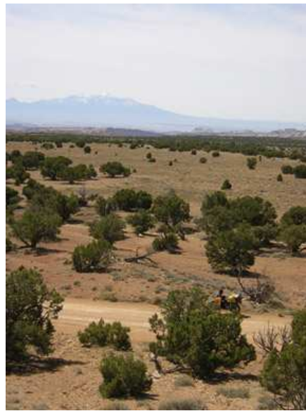
On the way out of San Rafael Swell to the south, two views from the same place. At left the way down to Goblin Valley and to Hiway 24 north of Hanksville. At right are the Henry Mountains in the distance. Incredibly (by my previous bicycle-touring standards), I'd be spending that night three quarters of the way up the opposite side of the Henrys.